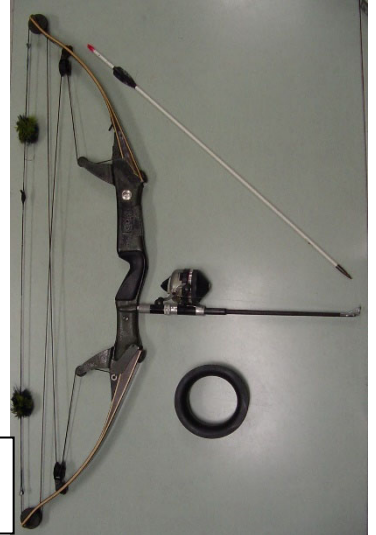
Example bow, archery fishing set-up and fishing arrow.